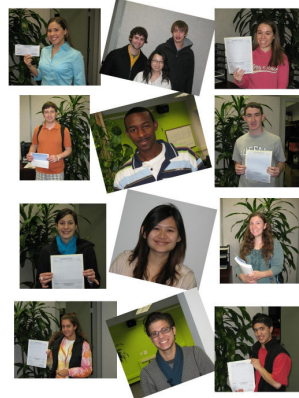
Past CURCA Award Winners